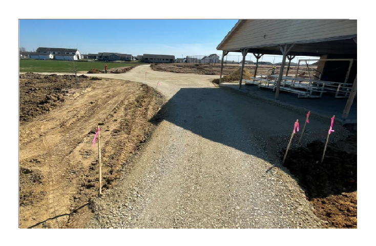
Sidewalk prep continues