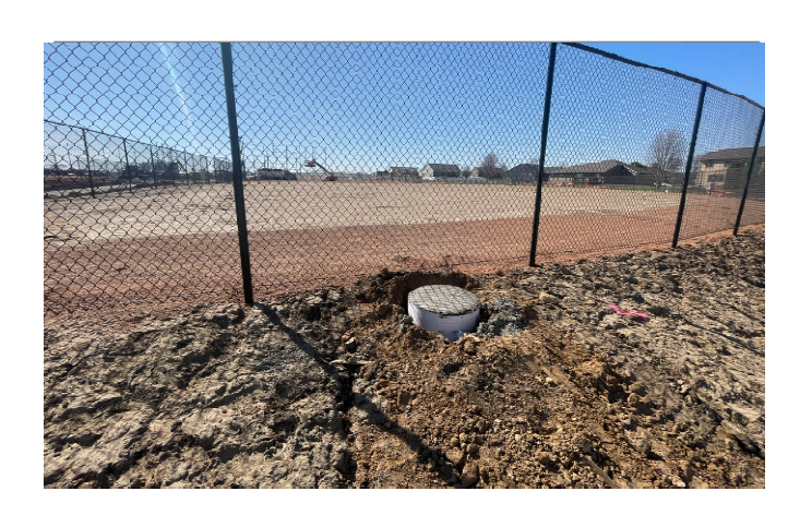
Foul pole bases poured