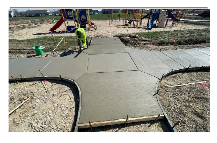
Sidewalk around playground being poured