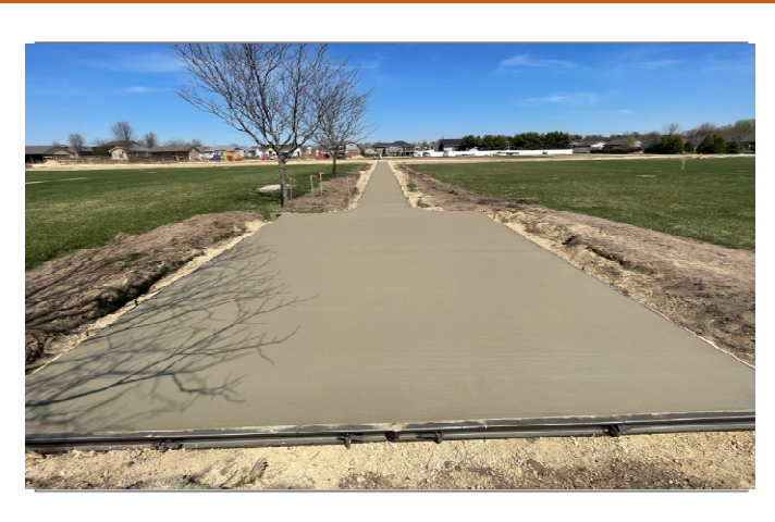
Soccer field pad poured with sidewalk