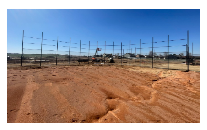
Baseball field backstop horizontals being installed