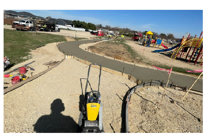
Sidewalk around playground pour in progress