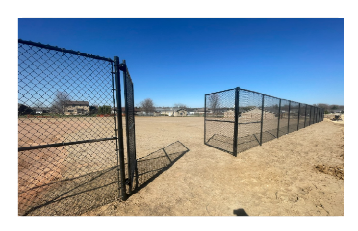
Gates being installed @ ballfields