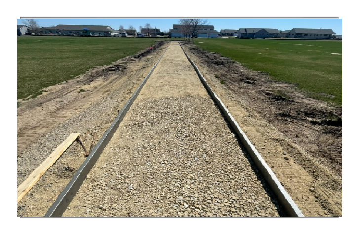
Sidewalk to soccer field pads prepped