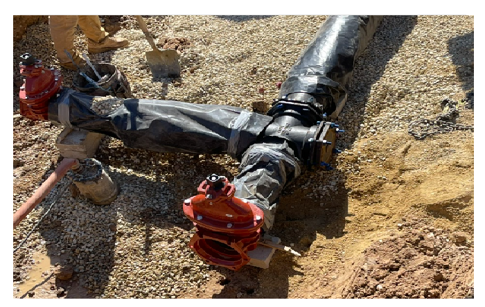
Water main off Wyler Dr. Tied in. North side left plugged for tie in by Fox