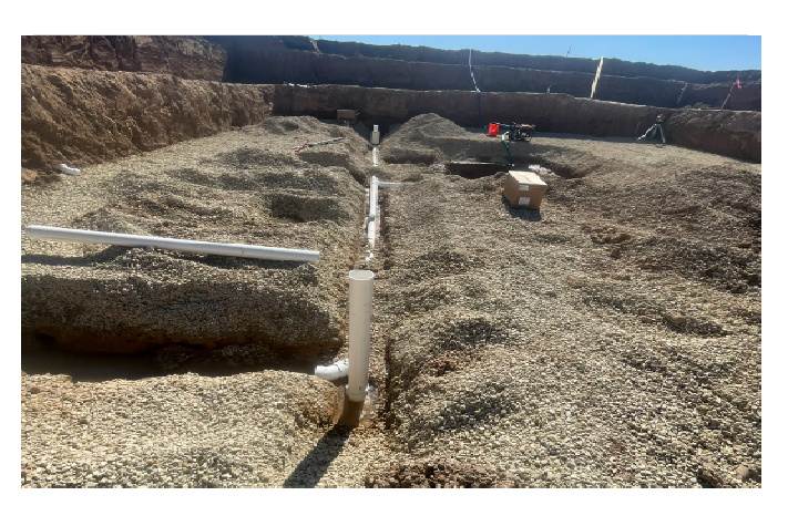
Plumbing in equipment building lower level